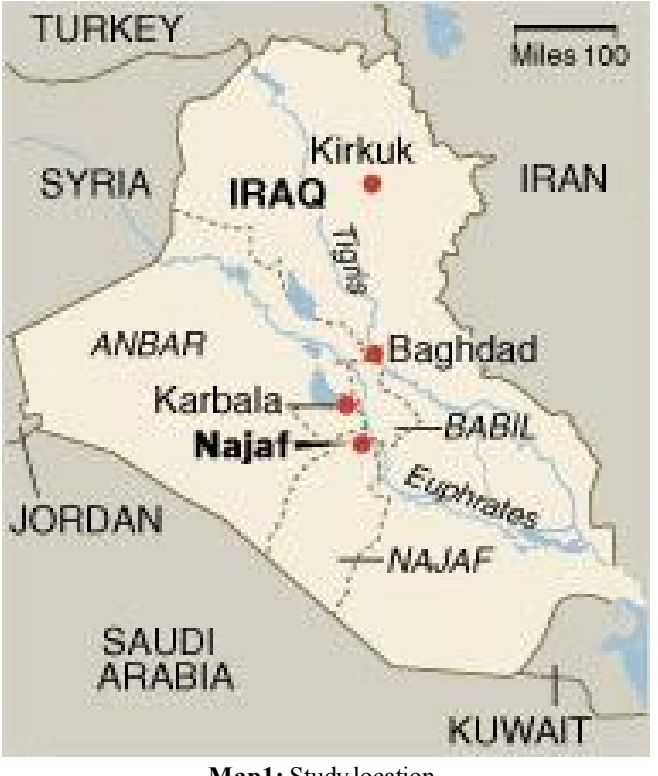
Map1: Study location.